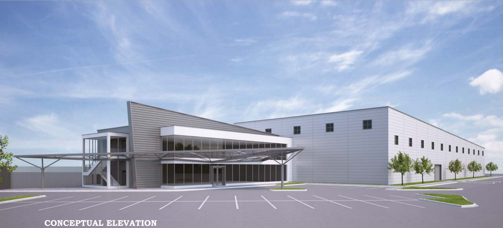
CONCEPTUAL ELEVATION Hangar "E" with Corporate Flight Facility

NOW PRE-LEASING!!! LOCK IN YOUR HANGAR TODAY!